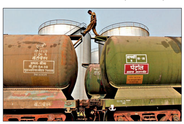
While western and eastern offshore facilities account for 50% of crude production, Rajasthan, Gujarat and Assam account for nearly the rest

dia's crude production, three states — Rajasthan, Gujarat and Assam - account for almost all of the balance.